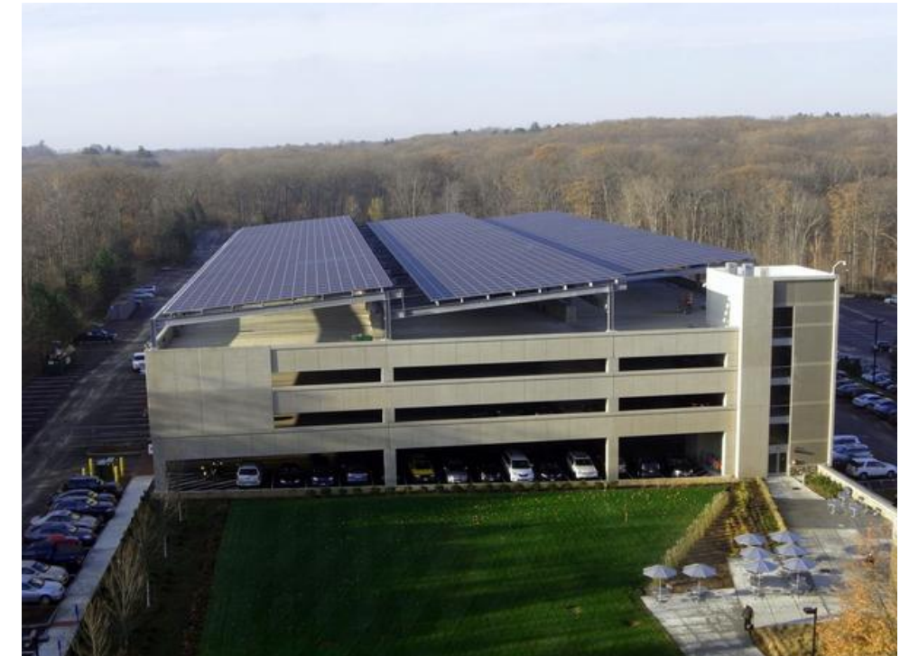
685-kilowatt installation at Staples headquarters in Framingham

Legislate increase in cap, or eliminate entirely, to reach goal of 1600 MW by 2020.